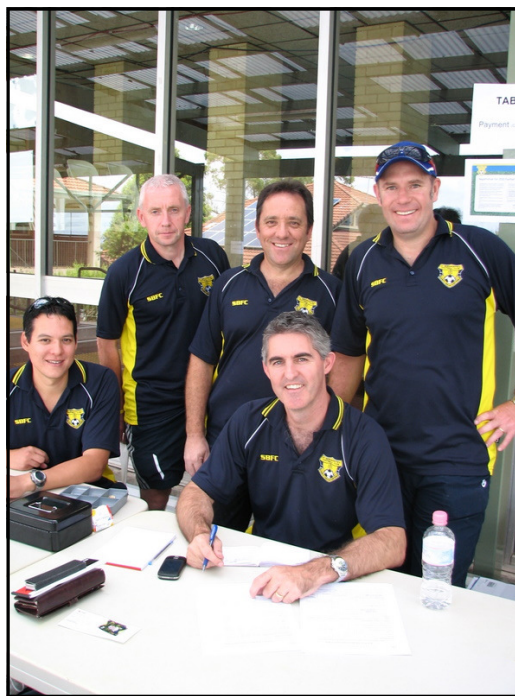
Some fathers at the St Bernadette's Football enrolment morning last year.

And it's the same with the church. That is why so many 'non-practising' Catholics still identify themselves as Catholics. They intuitively grasp